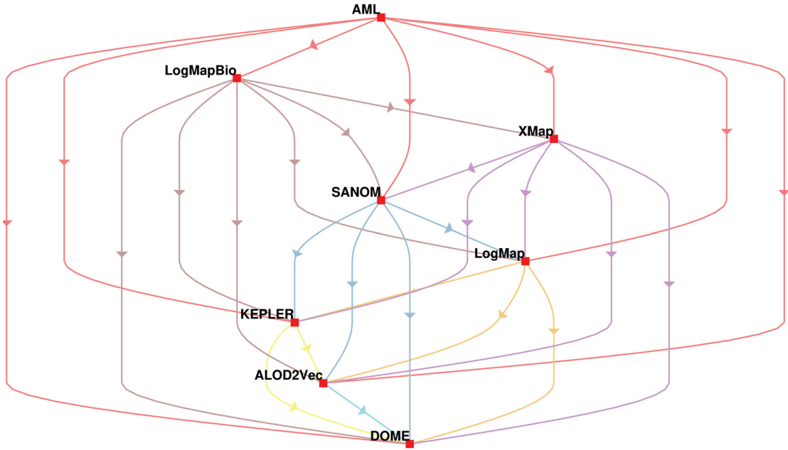
Figure 1 The comparison of participating systems in the OAEI 2018 anatomy track based on the McNemar's test with considering false positives. The nodes in the graph are the participating systems, and each directed edge A \rightarrow B means that A is superior to B