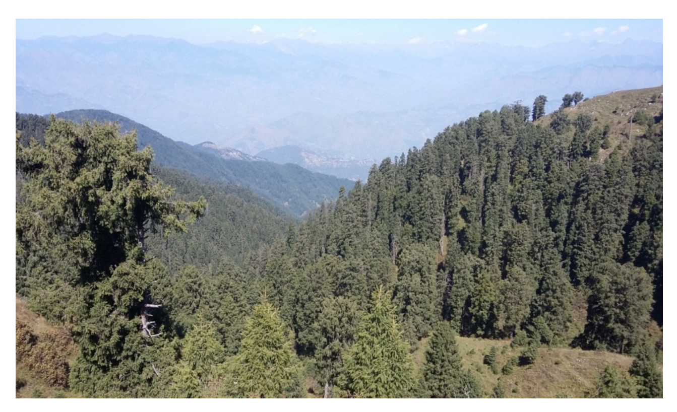
Fig. 1 – Collection site of Capnodium berberidis on Berberis lycium (Jot Pass, Chamba, Himachal Pradesh).