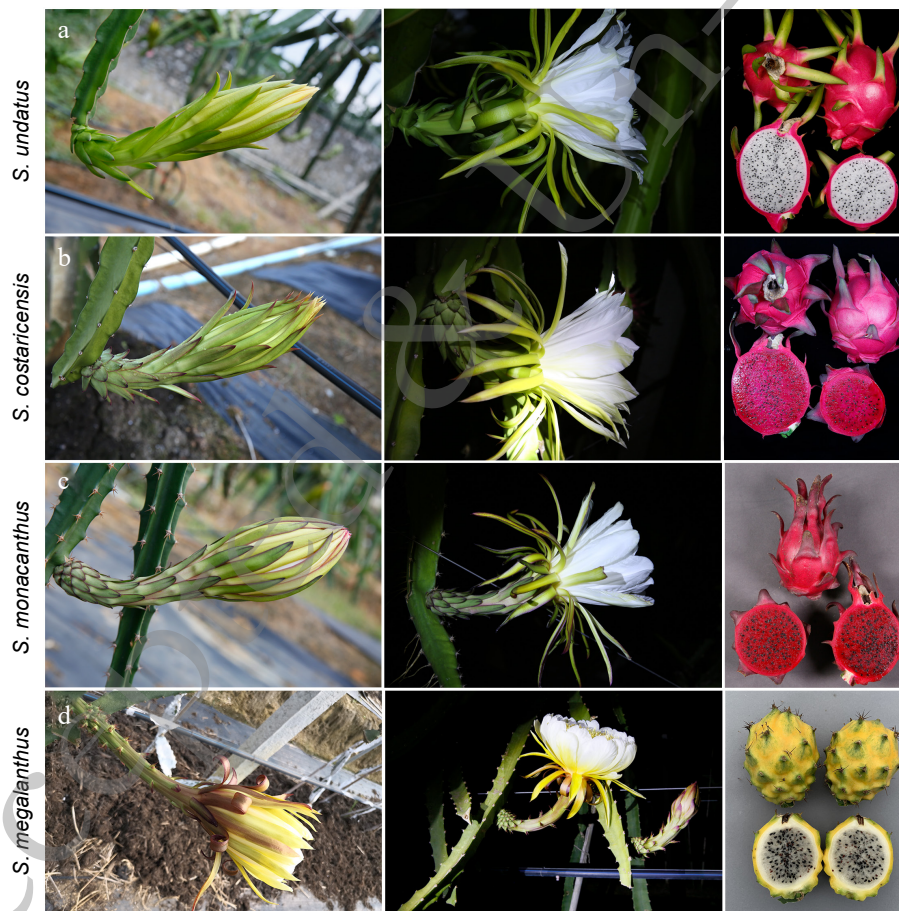
Fig. 1 The phenotype of bud, flower and fruit of four main commercial dragon fruits. (a) S. undatus has green buds; big, funnel-shaped, and white nocturnal flowers; and oblong fruits with pink peel, and white flesh and covered with green, long, and hard scales. (b) S. costaricensis has green buds along with lighter red edges on the outer perianth; big, funnel-shaped and white nocturnal flowers; and ovoid fruit with dark magenta peel and violet-red flesh, and covered with red, soft and short scales. (c) S. monacanthus has green buds along with bright red edges on the outer perianth; big funnel-shaped and white nocturnal flowers; and ovoid fruit with crimson peel and flesh covered with red, soft and short scales. (d) S. megalanthus has green buds along with dark brown outer perianth; big funnel-shaped (rounder than other species) and white (a little yellow) nocturnal flowers; and ovoid fruit with yellow peel and white (transparent) flesh covered with thorn on tuberculate skin instead of scales.

In China, the most widely cultivated varieties are red-flesh series, including 'Ruanzhidahong', 'Jindu 1', 'Guanhuahong' and 'Guihonglong 1', all of which belong to species of S. costaricensis . On the other hand, white flesh cultivator like 'Vietnam 1' is introduced from Vietnam and belongs to S. undatus , while 'Guanhuabai' and 'Baishuijing' are locally developed new varieties from S. undatus . Unlike earlier cultivated varieties, most commercial used varieties in recent years are self-compatibility, which helps reduce labor costs. However, the genetic background of the most collected dragon fruit germplasm remains unknown. Therefore, to promote the breeding of new dragon fruit varieties, it is necessary to conduct detailed and in-depth research on the genetic background and phylogenetic relation-