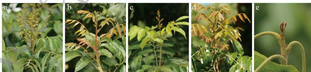
Fig. 1 Phenotypic variation of branches induced by \text{KClO}_3 in off-season flowering of longan. (a) buds exhibiting shoot-like morphology that undergo direct floral bud differentiation; compound leaves show inhibited growth or abscission. (b) initial shoot elongation followed by bud transition and morphological differentiation during the red leaf stage. (c) shoots exhibiting floral transition demonstrate a "flower with leaf" phenotype. (d) vegetative shoots develop without entering floral transition. (e) dormant buds that do not produce flowers or new shoot growth. Scale bars = 2 cm.

In Xiamen city of Fujian province, branches treated with \text{KClO}_3 in late September underwent significant changes in the apical meristem with a conical shape within two weeks post-treatment. Inflorescence primordia developed after 33 days, with the growth point transitioning to a hemispherical shape. By 37 days, both primary and secondary inflorescence primordia were observed [44] . Additionally, \text{KClO}_3 treatment enhanced the length and girth of new shoots, which was advantageous